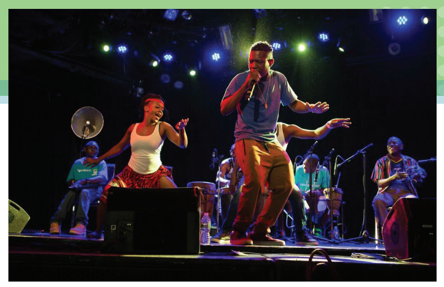
Jagwa Music (Season 3, Tanzania) at Le Poisson Rouge in New York, NY

Center Stage strengthens presenting organizations by increasing their capacity to host international work.